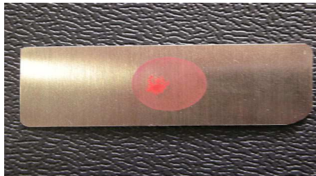
3. Lack or missing detergent or detergent not suitable