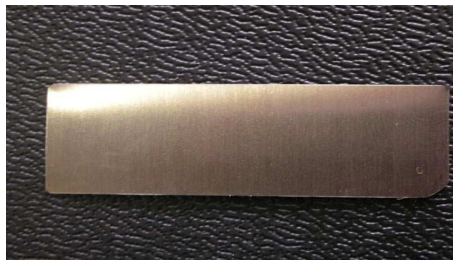
2. Test approved