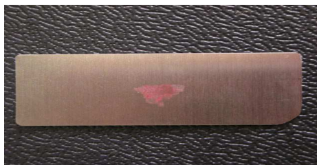
4. Temperature too low or inefficient water penetration/flow